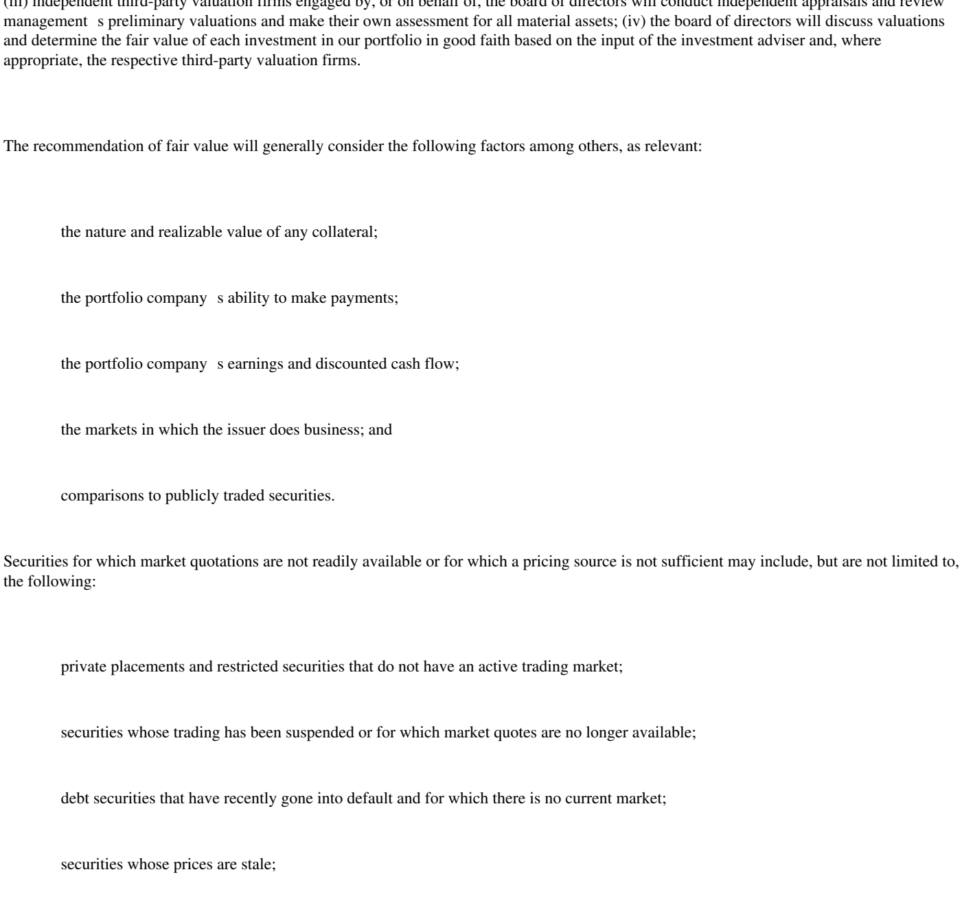
Table of Contents 143

Securities for which reliable market quotations are not readily available or for which the pricing source does not provide a valuation or methodology or provides a valuation or methodology that, in the judgment of our investment adviser or board of directors, does not represent fair value, shall each be valued as follows: (i) each portfolio company or investment is initially valued by the investment professionals responsible for the portfolio investment; (ii) preliminary valuation conclusions are documented and discussed with our senior management; (iii) independent third-party valuation firms engaged by, or on behalf of, the board of directors will conduct independent appraisals and review management s preliminary valuations and make their own assessment for all material assets; (iv) the board of directors will discuss valuations and determine the fair value of each investment in our portfolio in good faith based on the input of the investment adviser and, where appropriate, the respective third-party valuation firms.